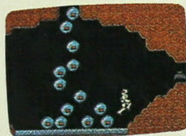
A gang of balder attack Thexder from behind.