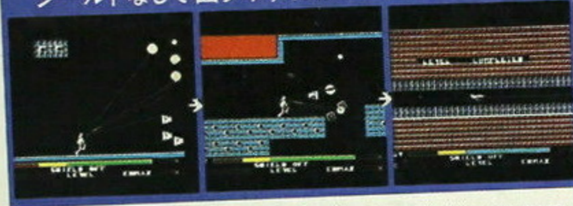
Actual graphic scenes expanded to show true animation sequences.